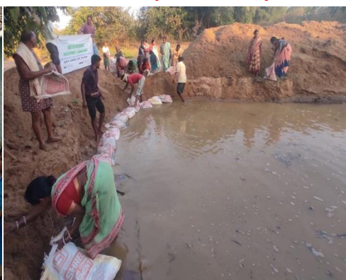
Bori Bandhan structure