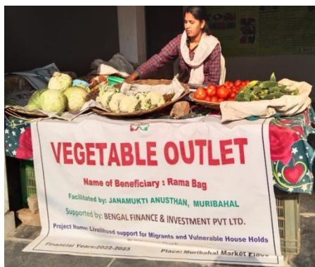
Inauguration of Vegetable Market Outlet