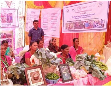
Demonstration of NPM