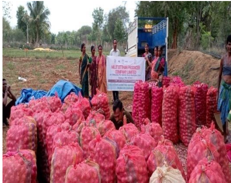
Collective marketing of onion through PC