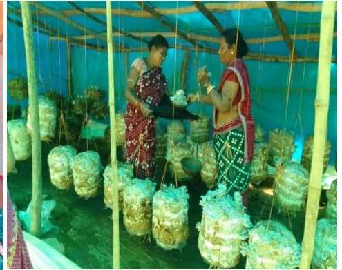
SHG involved in mushroom cultivation