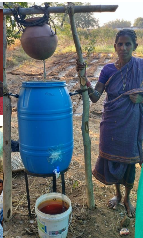
Demonstration of vermin wash