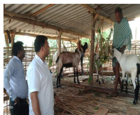
Goat shed structure

Sponsored by Azim Premji Foundation (Philanthropic Initiatives)