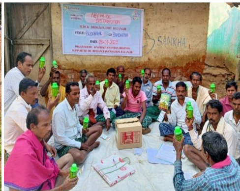
Promotion and distribution of Neem oil