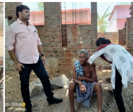
Camp visited by the Secretary, JMA