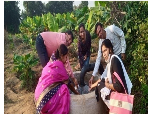
CRLP site of Maa Ghantasoni