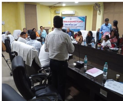
Sharing before the minister Sadhvi Niranjana Jyoti