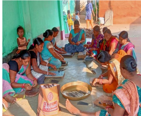
SHG making scented stick