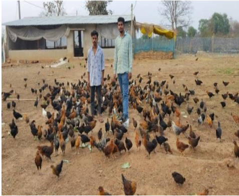
SHG involve in chick rearing