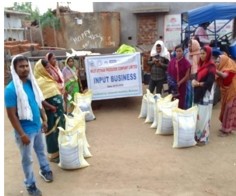
Input business through PC