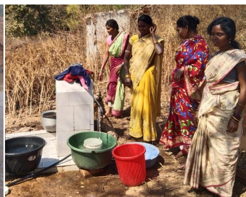
Access to safe drinking water