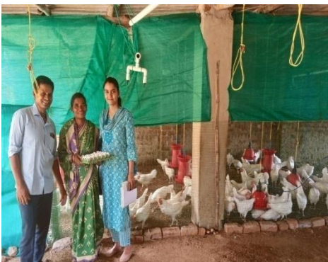
Visit of BRLF to Chick unit, Sarala PG