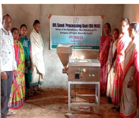
Oil extraction unit at Karlapita village