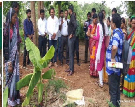
Visit of Sub-Collector to Maa Ghantasoni PG