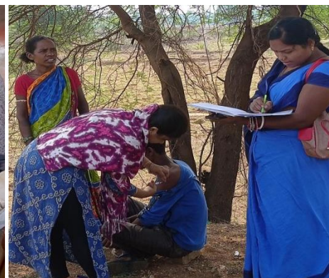
Vaccination at door step