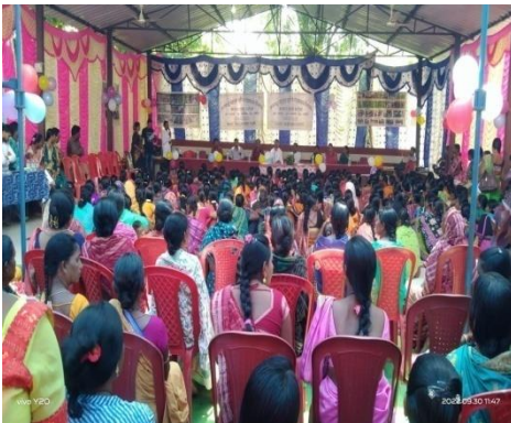
AGM of Milit Utthan PC