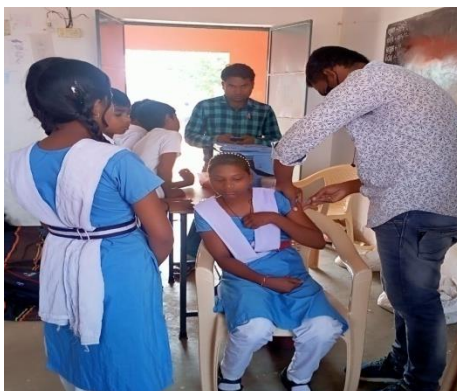
Vaccination of school children