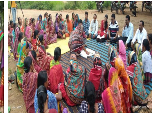
Crop planning activity