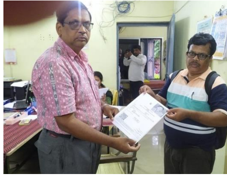
Received seed license from the DDH