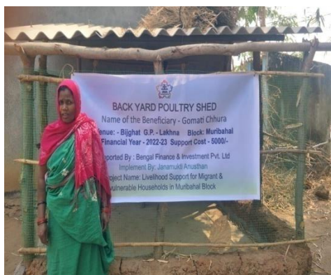
Support of BYP shed