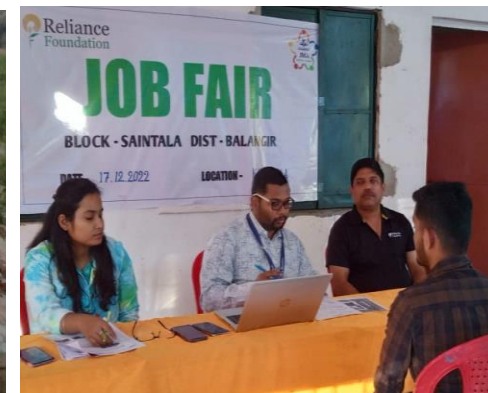
Job fare event