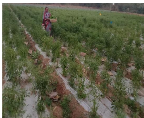
Adoption of technology-mulching & drip