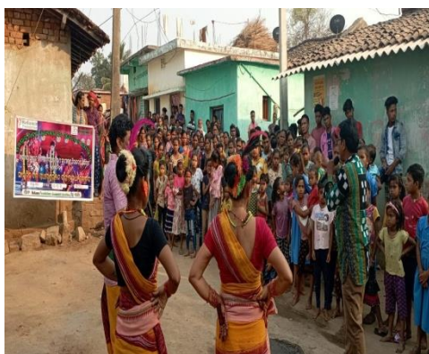
Mass awareness through cultural team