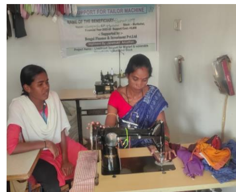
Support of tailoring machine to Belamati