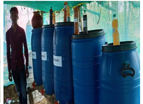
Vermi wash production through AE model