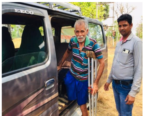
Vehicle facility for disabled person