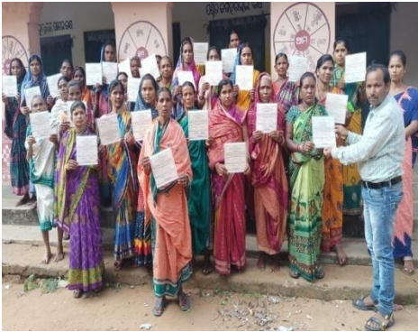
Distribution of share certificate