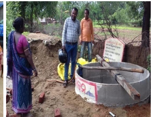
Creation of new irrigation infrastructure